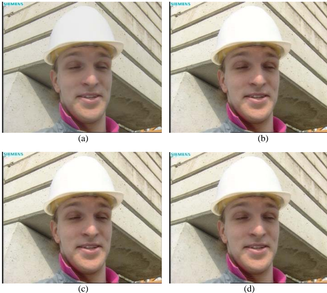
Figure 4. The first frames in Foreman video

This work was supported by National Science Council of Republic of China under grant NSC 93-2213-E-270-002.